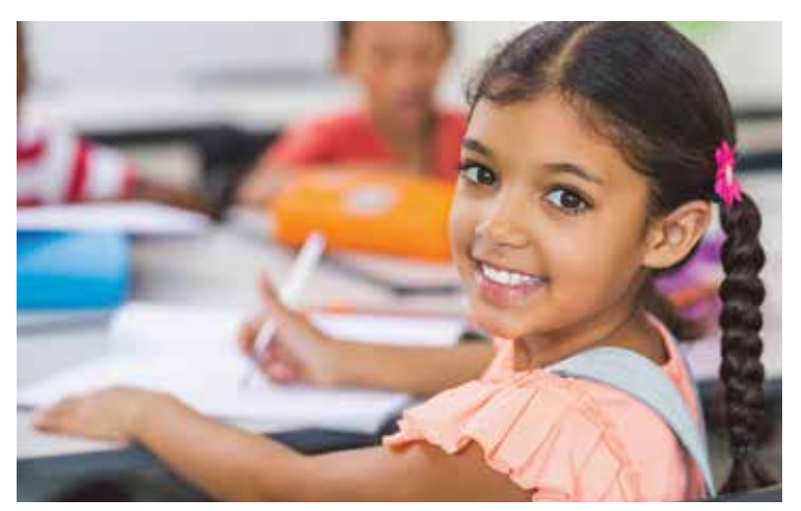
Clysar employees are active volunteers with Junior Achievement, extending school learning to life outside the classroom by providing lessons in financial literacy, work readiness and entrepreneurship.