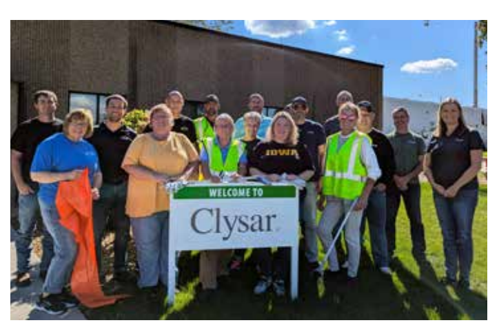
We participate in regular "clean and green" highway cleanups through the Adopt-a-Highway program.