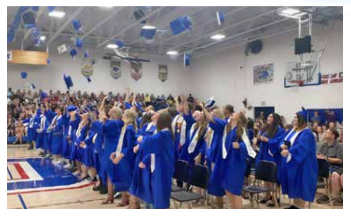
We proudly support Clysar families by awarding annual scholarships for secondary education.